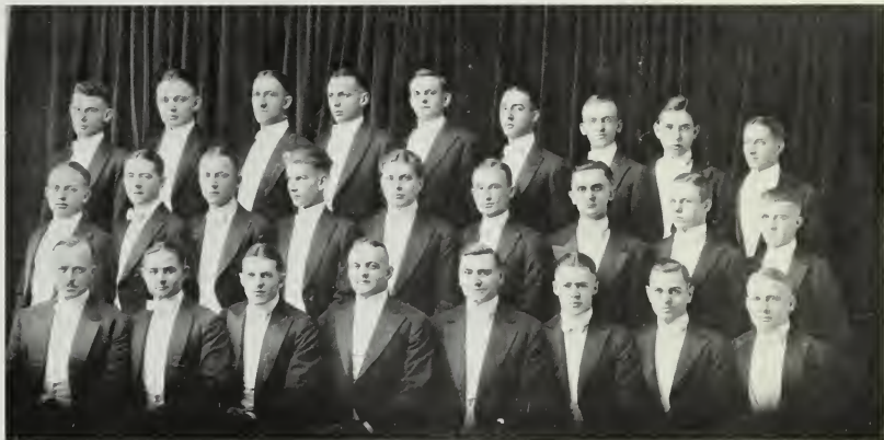
THE GLEE CLUB